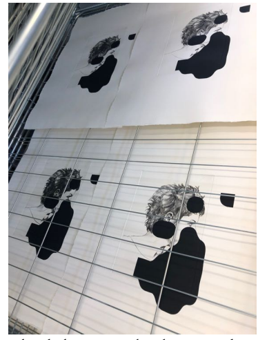
Above: Proofs from Melencholia III on the drying rack in Orchamps, France.